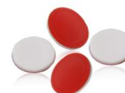
PTFE Silicone Septa