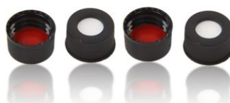
8-425 Cap and Septa